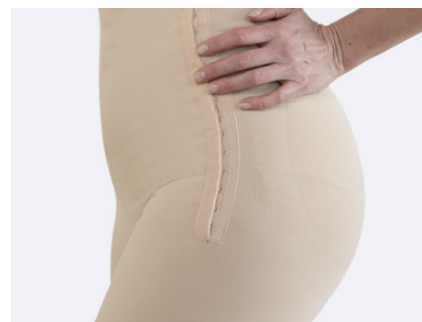
Extra support over the abdomen.