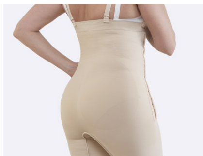
Shaped knitting to follow the body contour.