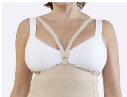
The adjustable shoulder straps can be attached in the middle front or sides.