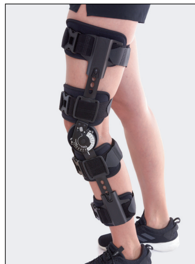
With the telescopic mechanism, the length of the orthosis can be adjusted, from 48 cm to 63,5 cm.