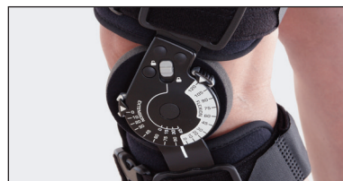
Extension and Flexion can be adjusted and locked from 0° to 45° in intervals of 10°/15°. Controlled range of motion between 0° to 120° is easily set with a pushbutton in intervals of 10°/15°.