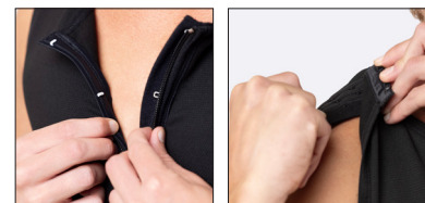
Adjustable shoulder straps. Zipper with hook-and-eye.