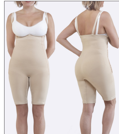
Hook and eye closure in both sides and removable shoulder strap.