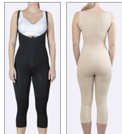
Hook and eye closure in the middle front and a wide back.