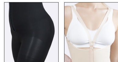
The shoulder straps can be attached at the front or in the sides.