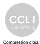
Compression class I