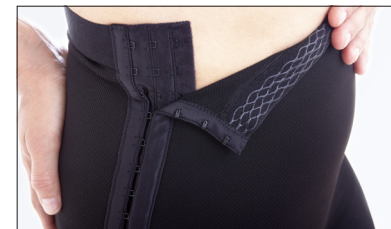
Hook and eye closure on both sides and silicone waistband.