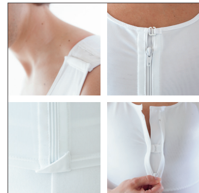
Adjustable shoulder straps. Zipper with hook-and-eye and soft cover.