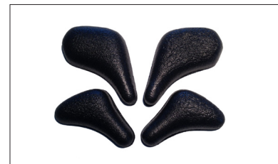
50257-00-50 Pads, Medium 50257-00-60 Pads, Large