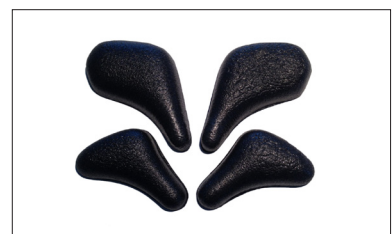
50257-00-50 Pads, Medium, 50257-00-60 Pads, Large