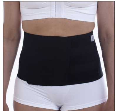
ViraRak 20 cm, 50231