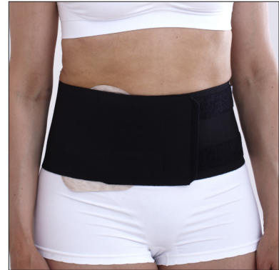
ViraRak 15 cm, 50230