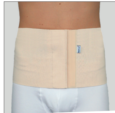
50204: 25 cm