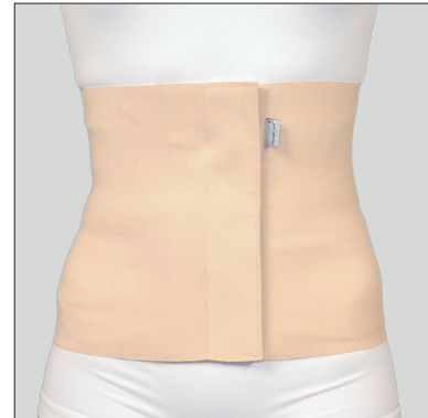
50205: 30 cm