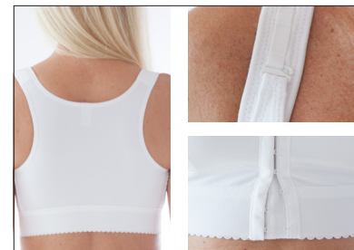
Racer back. Adjustable front and shoulder straps.